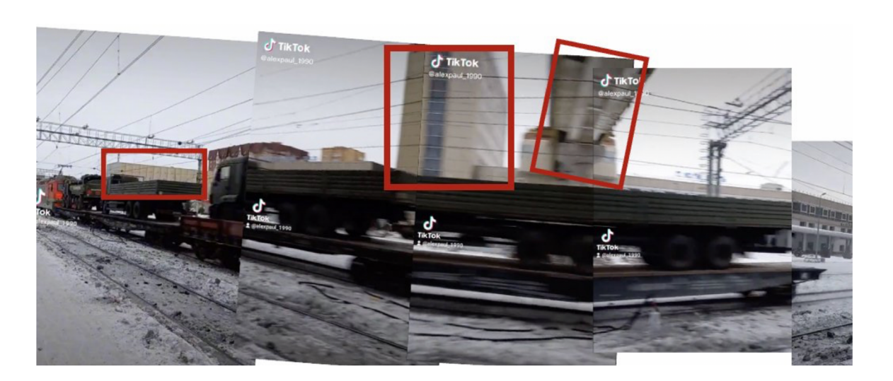
Figure 3: Images Captured on Social Media of Russian Military Equipment Being Transported Towards the Ukrainian Border in February 2022

Sources: Ross Burley, 'Eyes on Russia Project: Latest Development', Centre for Information Resilience (CIR), 15 February 2022, <a href="https://www.info-res.org/post/eyes-on-russia-project-latest-developments">https://www.info-res.org/post/eyes-on-russia-project-latest-developments</a>, accessed 18 May 2022; TikTok.