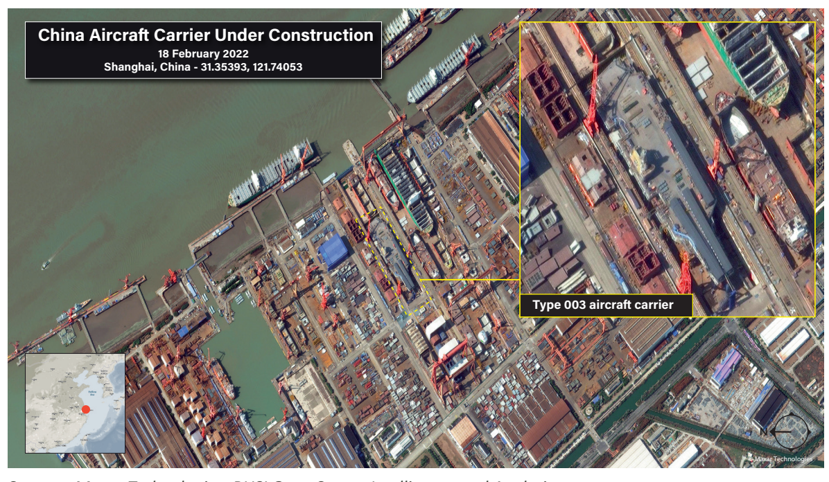
Figure 4: Commercial Imagery of China's New Liaoning-Class Aircraft Carrier