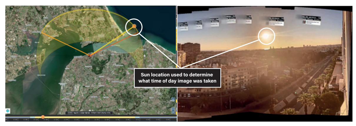
Figure 5: Global Investigative Journalism Network Shows How to Chronolocate an Image from Social Media and Assess What Time a Photo Was Taken Using SunCalc