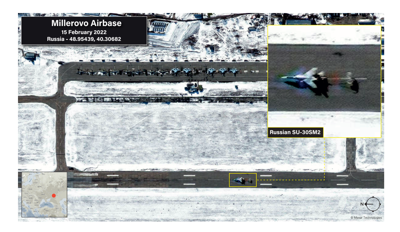
Figure 6: Satellite Imagery of a Russian Airbase with a Russian SU-30SM2 Landing on the Runway in February 2022