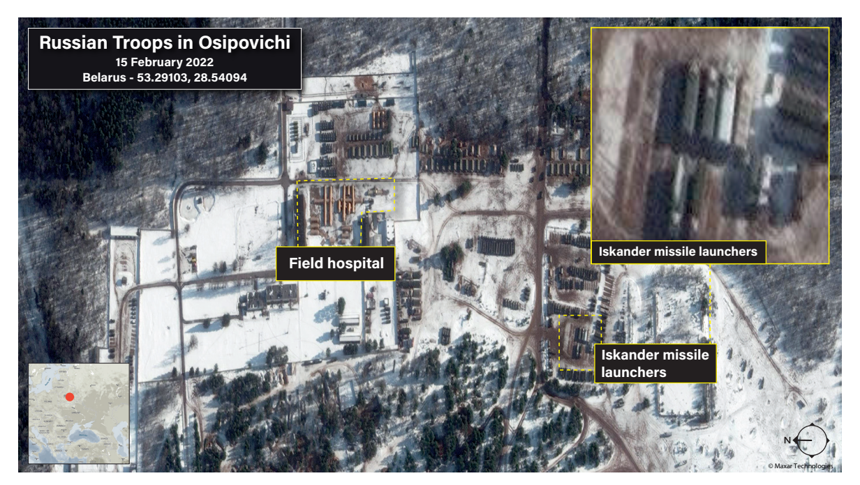
Figure 1: Example of Satellite Imagery Used to Assess Russian Troop Locations Prior to the Russian Invasion of Ukraine in February 2022